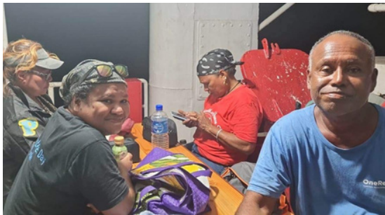
Safe on Board SSC Ksau - March 4 6:45 PM

It is still unclear why the boat carrying the outreach persons failed to reach Peleliu. However, this incident underscores the importance of taking safety precautions and being prepared when going out to sea. As of now, there are no announcements regarding any follow-up actions or lessons learned from the mission. Meanwhile, the SSC KSAU will proceed to Helen Reef to complete their project with SSC Techall and return next week.